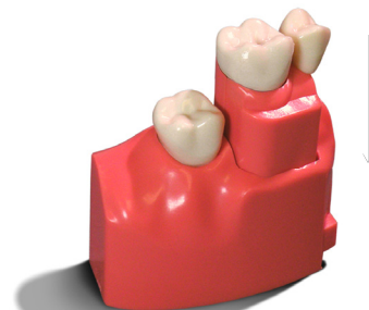
Insert the Breakaway Insert into the AE13-15 module.