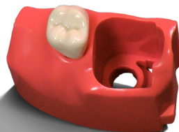
Artificial Endo Module AE13-15. (Item #RT_AE13-15)