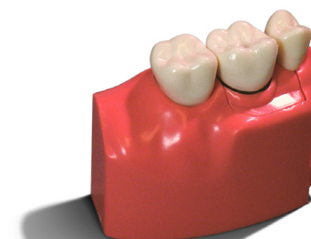
Push the Breakaway Insert until all teeth are at the same occlusal plane.