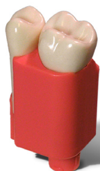
Real-T Endo tooth #14 in Breakaway Insert. (Item # RT_AE401WI_14RL)