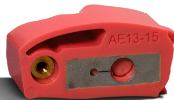
Bottom view of Artificial Endo module. To remove the Breakaway Insert, push the insert from the bottom of the module.